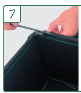
Take the remaining poles and thread into sleeves in the planter fabric.

Insert medium poles into all four of the open elbow sockets so that your uprights are vertical.