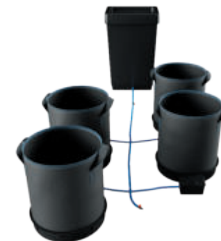
4Pot XXL 50 (50L pot - excl. adaptive collar)