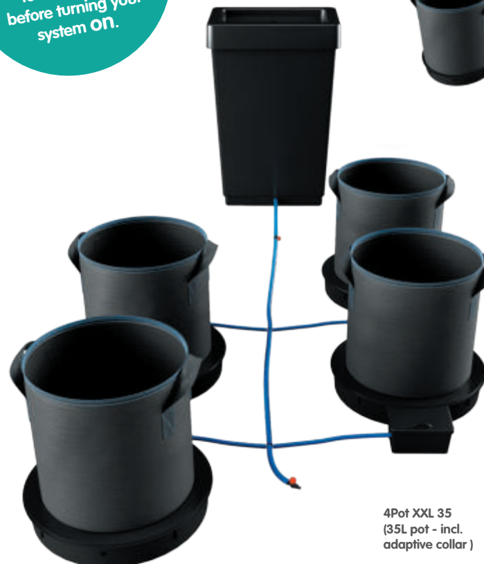
4Pot XXL 35 (35L pot - incl. adaptive collar)